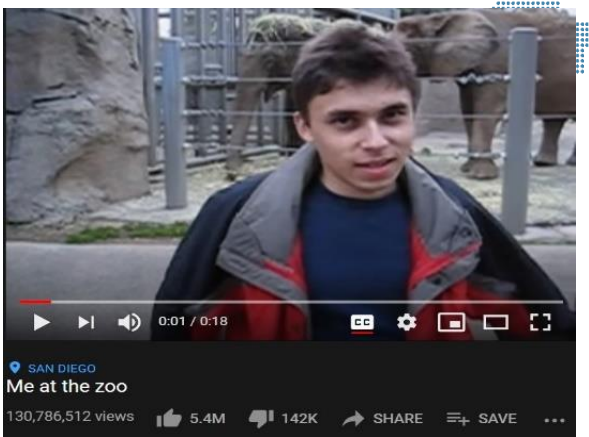
Figure 3. First video of YouTube channel

But after a year of travel, in 2006 Youtube was bought to be taken over or acquired by Google with a value of more than 1.65 billion US dollars. At that time, Google acquired it because YouTube had great potential, and it's true that YouTube is now known to many people because it is the most popular video site among the public.