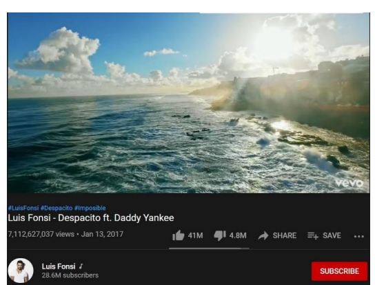
Figure 4. The video clip of Despacito

In 2017 Luis Fonsi was crowned the Ambassador of Tourism for Puerto Rico, for making Puerto Rico popular internationally thanks to his "Despacito" video clip.