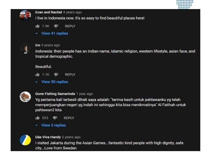
Figure 2. Positive comments on Video Wonderful Indonesia: A visual Journey

where the person lives, the research will be more detailed. Apart from positive comments, the video has also received reactions from YouTubers (YouTube users).